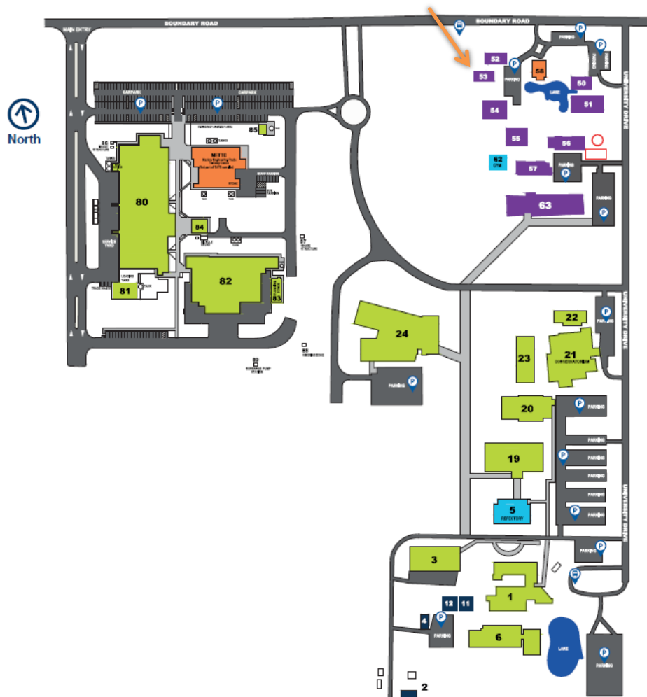
Figure 1 Site Location