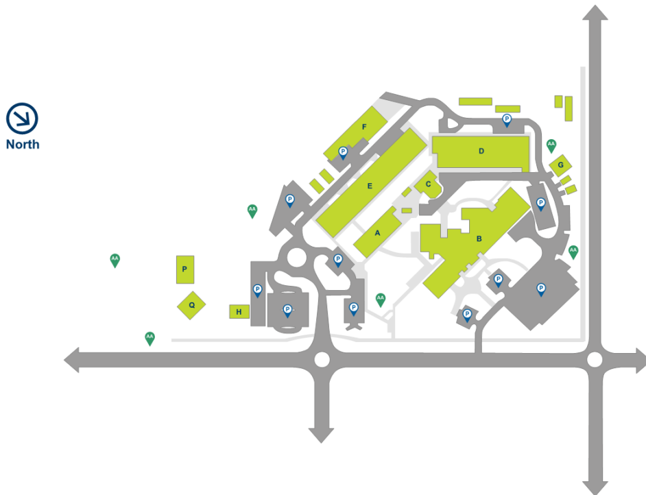
Figure 1 Site Location