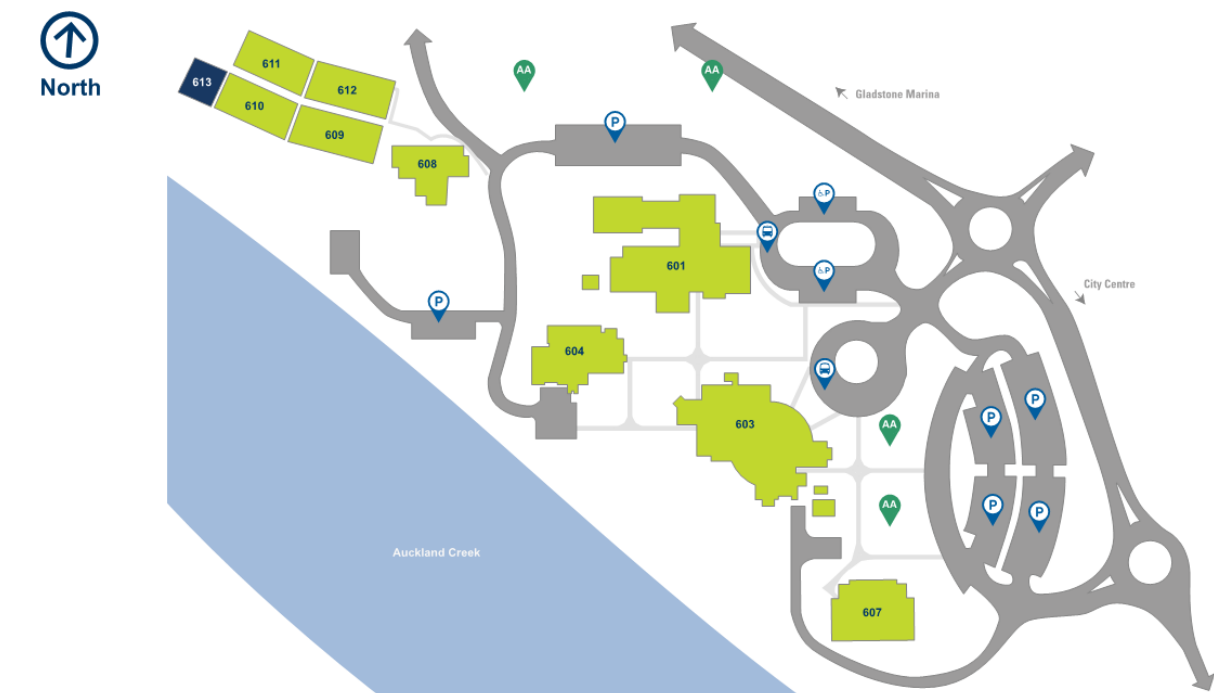
Figure 1 Site Location